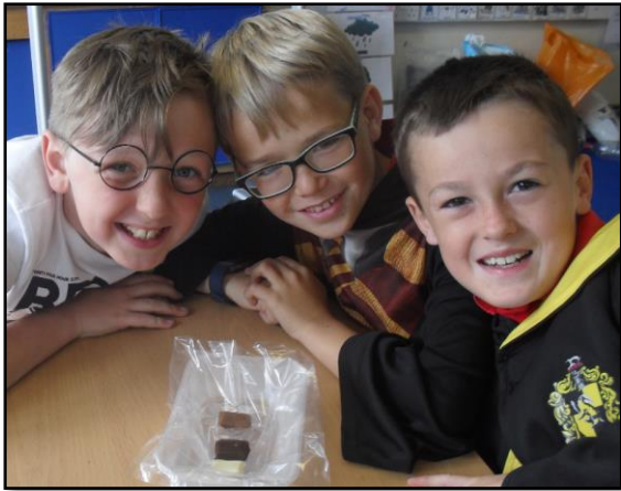
A magical wizardry science day!