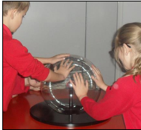
A visit to the Science Museum in London

Through our partnership with a local secondary school, we offer a term of curriculum enrichment in STEM for our more able scientists in upper key stage two.