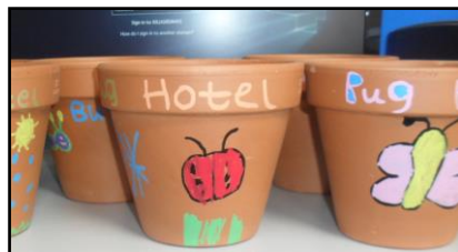
Learning about habitats and creating bug hotels in Reception