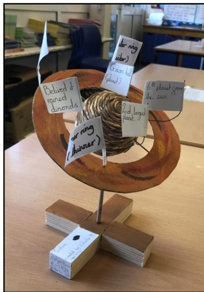
Year 5 made models of a planet with some key facts included.

Our knowledge curriculum progression covers statutory objectives, but also provides additional challenge ideas to engage and inspire all learners.