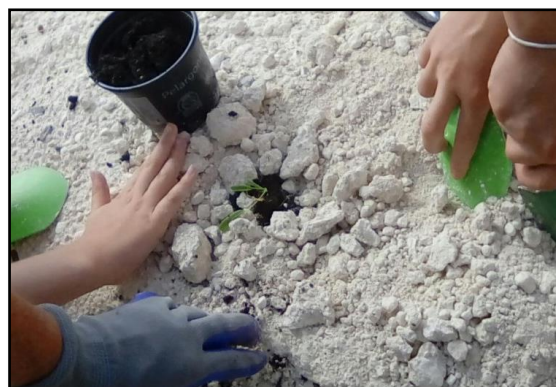
Killigrew Reception children planting plants and sowing seeds on a chalk bank to encourage the rare Small Blue Butterfly to live in the local area.

We also engage in local initiatives linked to our science curriculum and conservation. This included supporting a lottery bid for planting a chalk bank for endangered butterflies.