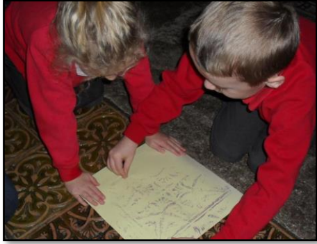
Printing in St Albans Abbey