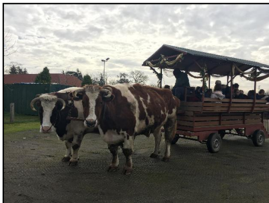
Year 4 trip to Bhaktivedanta Manor