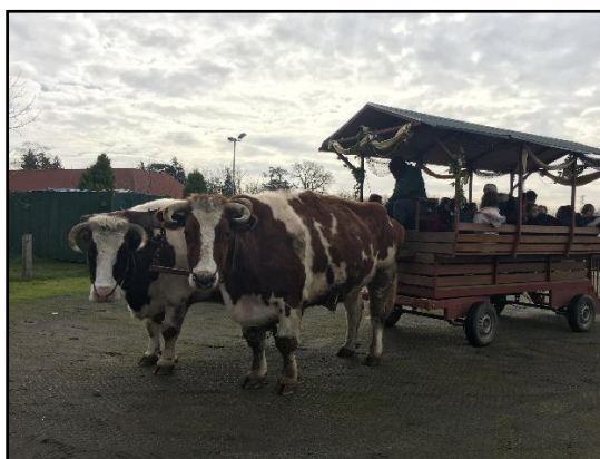
Year 4 trip to Bhaktivedanta Manor