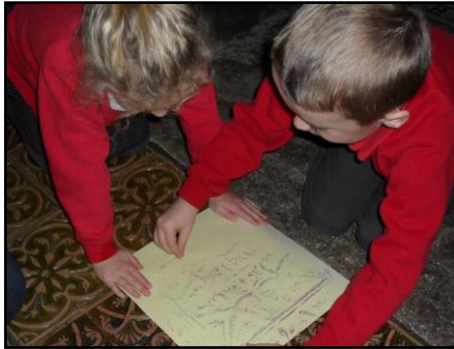
Printing in St Albans Abbey

monitor the children's books carefully to check progression as the children move through the school and we observe the teaching of RE, offering professional development opportunities if needed.