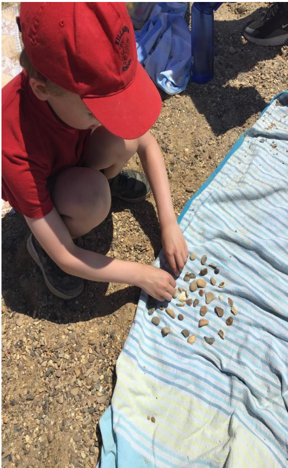
The children sketched some of the features they could see and created patterns using the stones and pebbles.