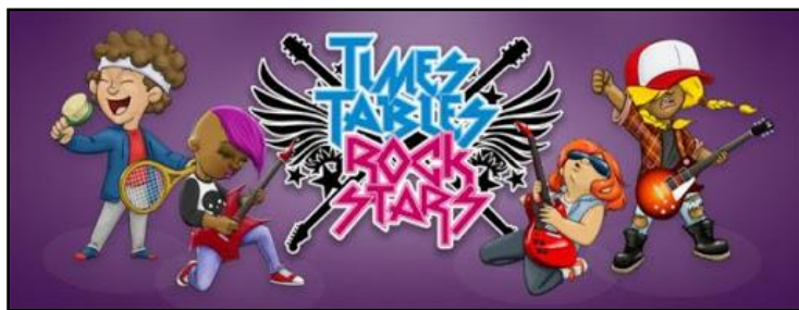
Times Table Rock Stars online learning resource

Our classrooms and displays provide a wide range of mathematical resources and language to enhance cultural capital and facilitate cross- curricular links. From year 2 to year 6, we have a sharp focus on multiplication , which we promote through our use of Times Table Rockstars. This programme supports children with their rapid recall which we have noted as a fundamental skill when ensuring that our learners become efficient mathematicians. We encourage maths learning to continue beyond the school day through this resource, and by providing carefully planned home learning tasks.