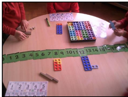
Year 1 representing numbers using Numicon

Within all units of work, there are opportunities to sharpen fluency in varied contexts, see modelled and worked examples, explore exemplification of mathematical talk and reasoning and independent rehearsal and problem solving. We regularly use 'destination' questions and reasoning tasks such as 'odd one out', 'prove it' or 'error spotters' for pupils to showcase their learning over a lesson, or when exploring a concept at greater depth.