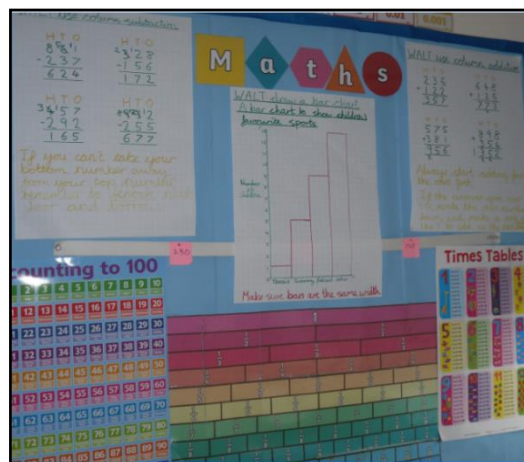
An example of a maths learning wall