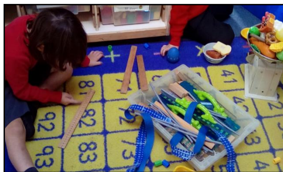
Mathematical exploration in Reception

In line with the National Curriculum, the complexity of the learning increases with each revisit. Each learning sequence across the year is progressive and sequential with clearly defined end points. These units are designed to address gaps in knowledge and skills through a range of activities. We have noticed that carefully planning for a wide range of activities, including activities that have a real-life context, embeds children's secure understanding of mathematics, and creates comprehensive mathematicians who are able to apply their mathematical knowledge to the world around them.