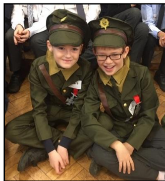
A VE Day tea party