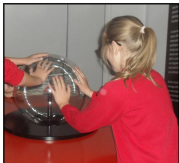
A trip to the Science Museum