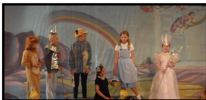
The Wizard of Oz

In addition to this, as part of our usual music teaching, the children perform a Christmas, Easter and summer performance to their parents. All of this wonderful provision supports our Year 6 children in producing a fabulous end of year show for their parents. In the past, we have produced The Lion King, The Wizard of Oz and High School Musical.