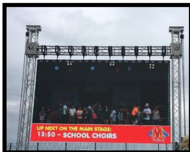
The M Festival at Marlborough School

There are different clubs available for children before school, at lunchtime and after school. Our clubs at lunchtime are completely free of charge and school staff run these. Through class provision and extracurricular practise, we work towards various school supported external performances across the school year: the St Albans Abbey Carol Concert, the St Stephen's Parish Council Nativity Performance, The Alban Arena Music Festival and The M-Festival at Marlborough School. The clubs we have available for the performing arts are many and varied: