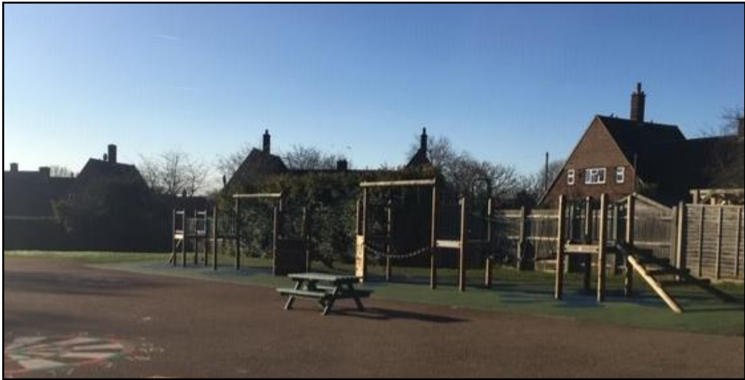
Climbing apparatus funded by our PTA