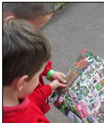
Map reading at the wildlife park