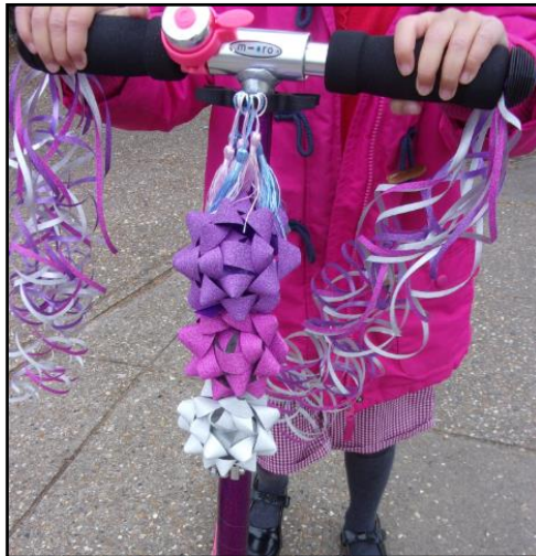
Bling your bike (or scooter)

Our parents are a key part of our community and we provide opportunities for them to come into school and enjoy their child's learning including 'book looks', sports events, assemblies and events like our annual poetry busk.