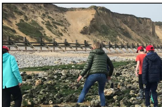
Coastal studies in West Runton in Norfolk