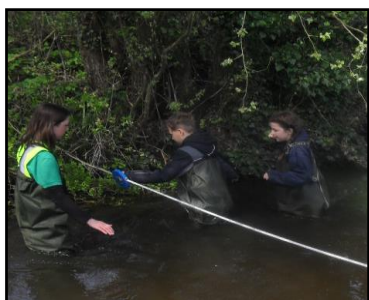
Year 5 river studies in Norfolk