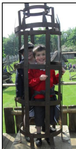
A visit to Mountfitchet Castle