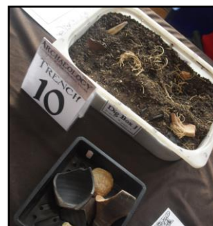
A Roman workshop