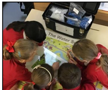
Learning about water conservation and clean energy

Through learning about global sustainability with our global curriculum weeks, our children understand their responsibility to the world we live in.