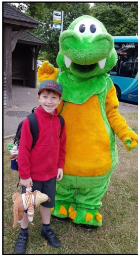
Buster the safer travel dinosaur