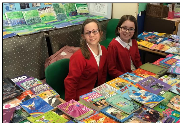
A child led fundraising initiative to raise money following the Australian bushfires