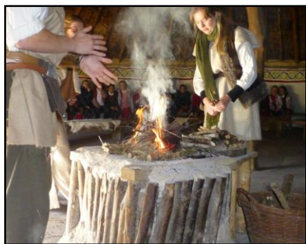
A trip to Celtic Harmony