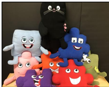
The Jigsaw PSHE Puzzle Characters

We measure the impact of our PSHE teaching in different ways: we conduct pupil voice to ascertain the children's thoughts and feelings on their mindfulness, emotional literacy and their learning in